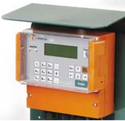
Operating Unit for local control, power and cable connections.